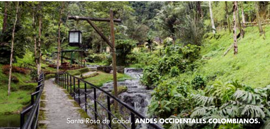
Santa Rosa de Cabal, ANDES OCCIDENTALES COLOMBIANOS.

It's a tinto , not a small americano. It's a tinto bien cargado , not an espresso. It's a doble , not a large americano. It's a medialuz , perico or pintado , not a cappuccino.