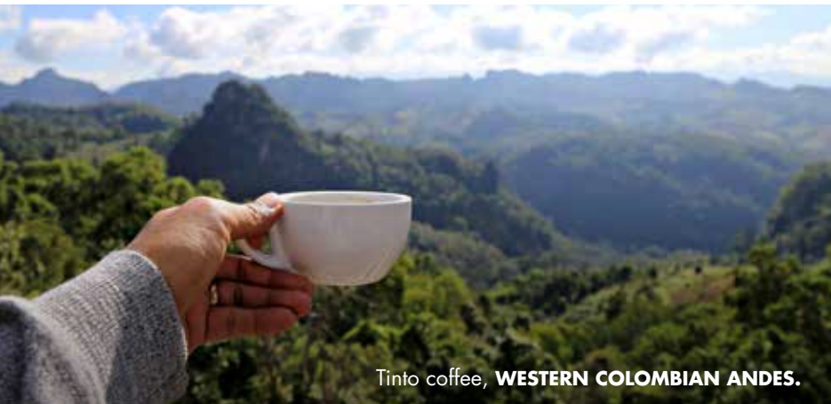
Tinto coffee, WESTERN COLOMBIAN ANDES.

People from Risaralda are adventurous, active, with a curiosity that reflects their own migrant soul.