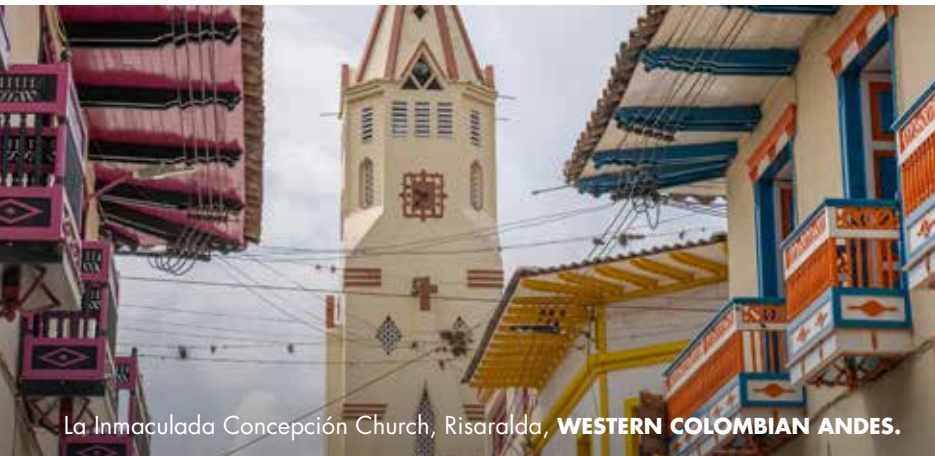
La Inmaculada Concepción Church, Risaralda, WESTERN COLOMBIAN ANDES.

The heritage of its migratory flows brought the chorizo, the Jeep and the arepa (corn patty).