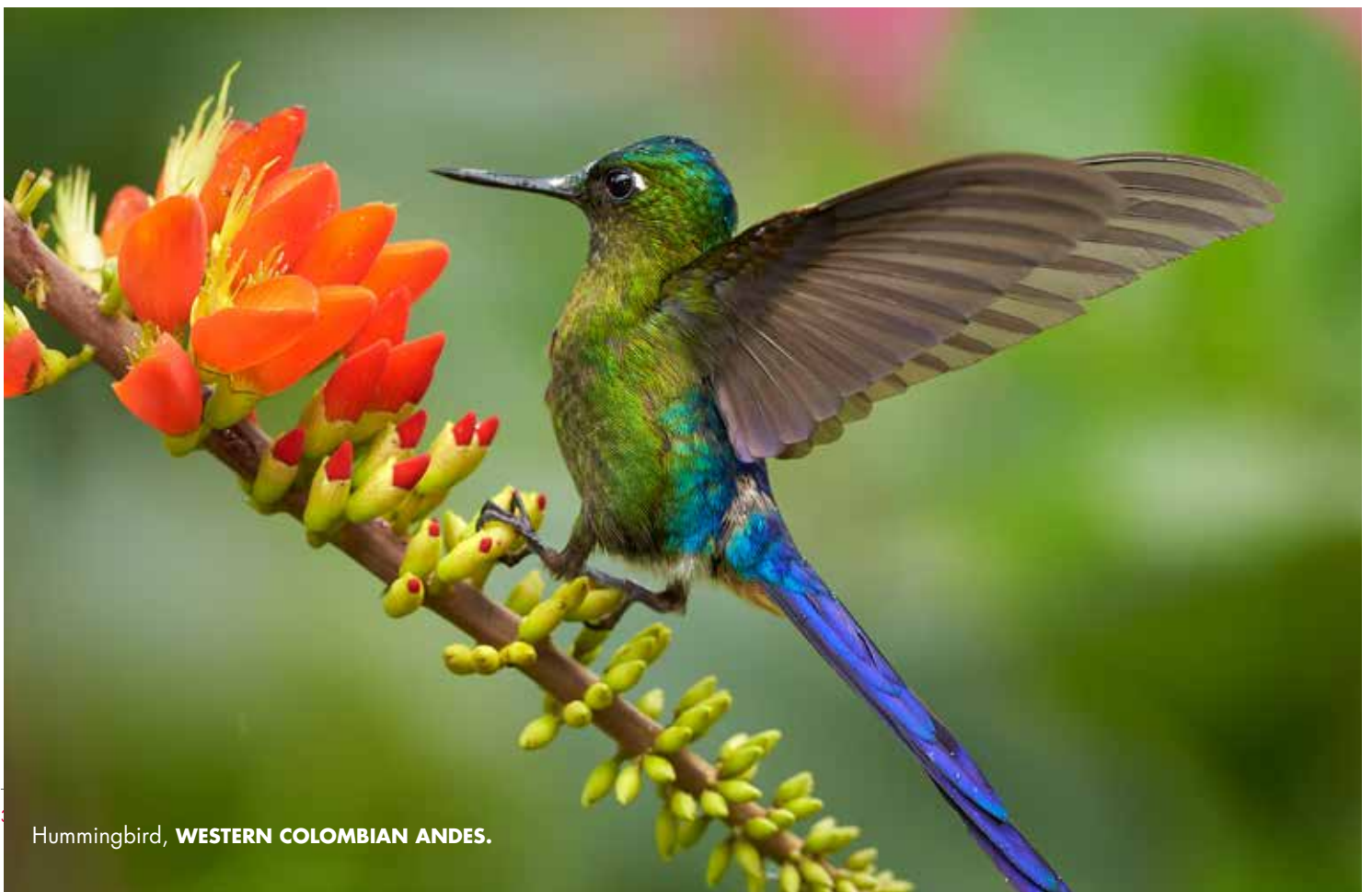
Hummingbird, WESTERN COLOMBIAN ANDES.

"In Risaralda we have a passion for the outdoors, so whether its adventure sports or observing nature, you can enjoy all kinds of diverse activities. We are mountaineers, mountain folk, people rooted to their land."