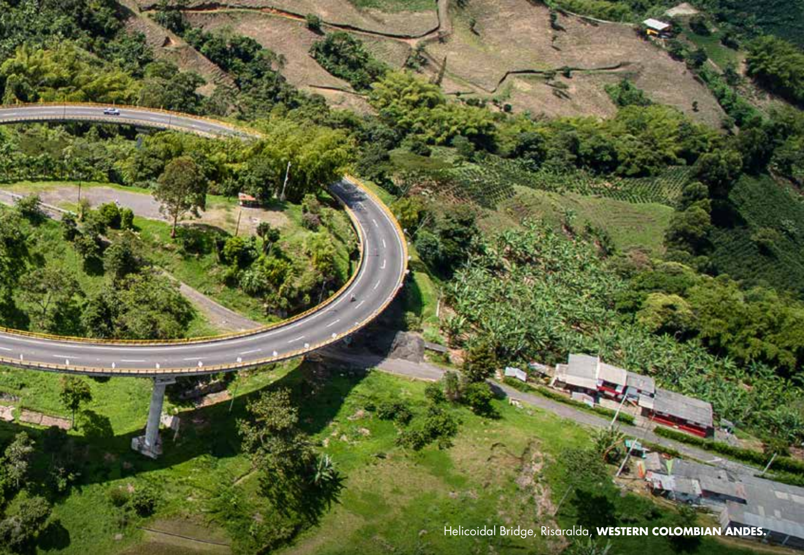
Helicoidal Bridge, Risaralda, WESTERN COLOMBIAN ANDES.