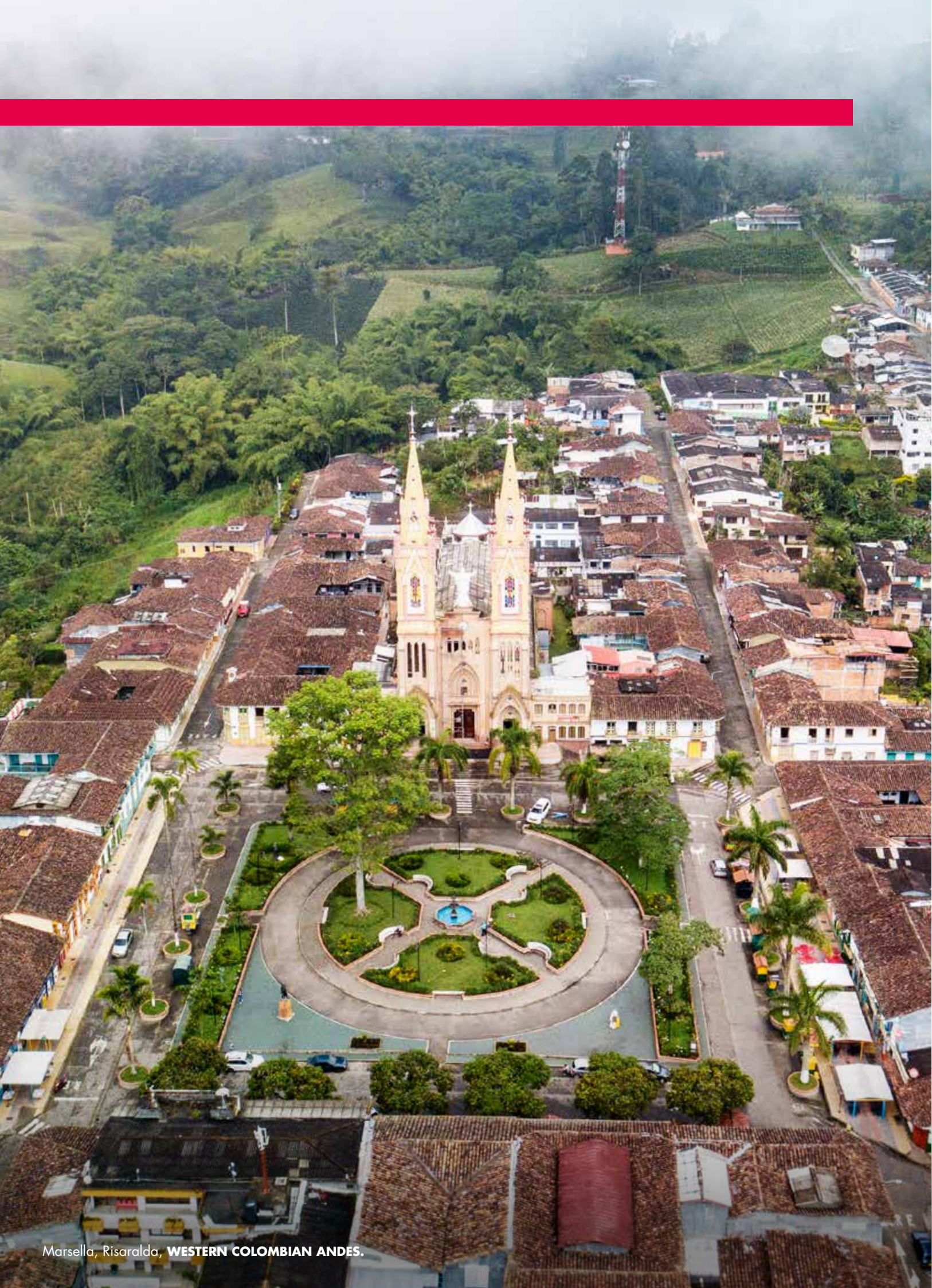
Marsella, Risaralda, WESTERN COLOMBIAN ANDES.