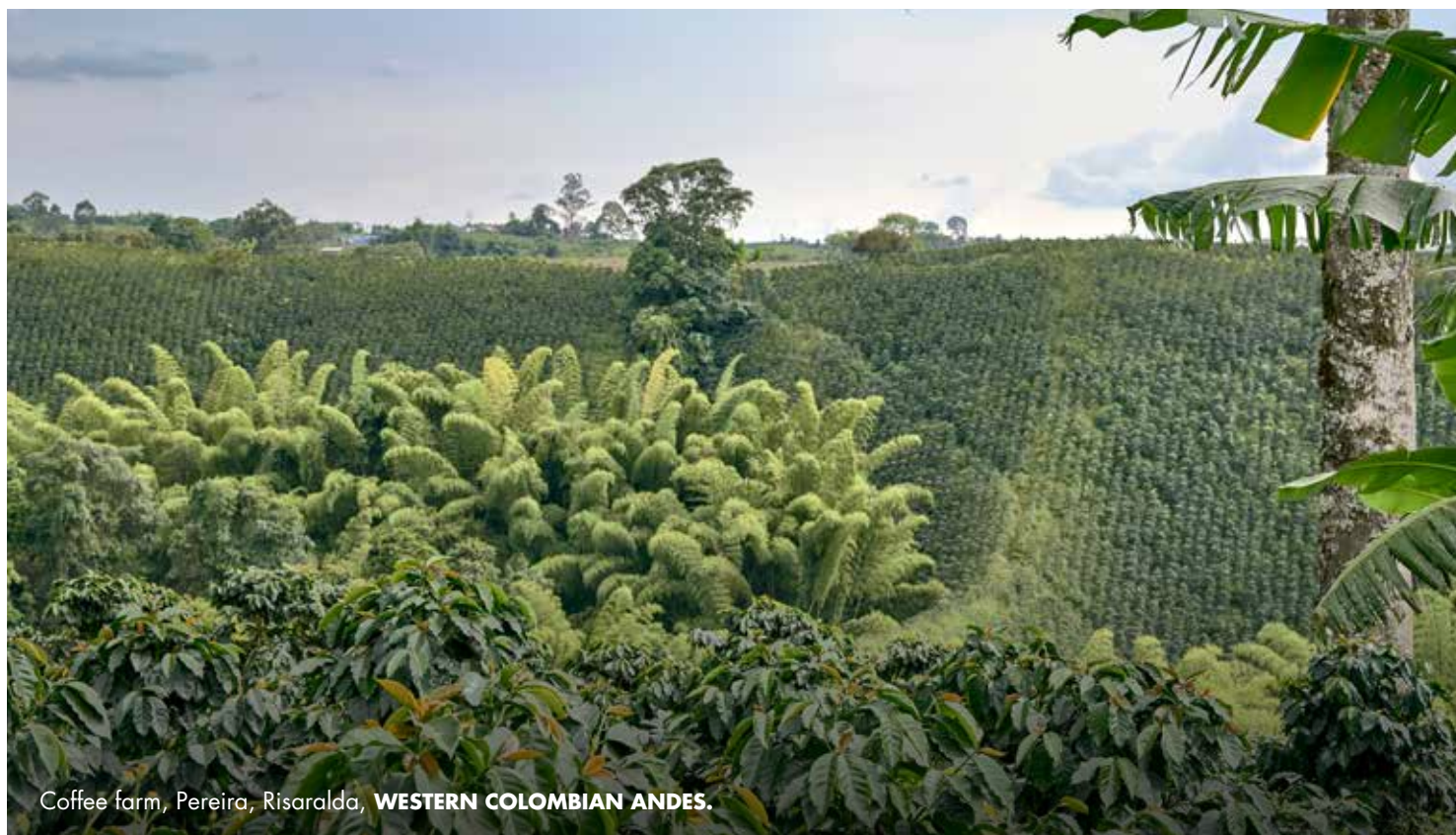
Coffee farm, Pereira, Risaralda, WESTERN COLOMBIAN ANDES.

The people of Risaralda have forged a very family-based, friendly, visionary, open, curious, enterprising and global personality, from the synthesis of migrant cultures that inhabited and still inhabit the department.