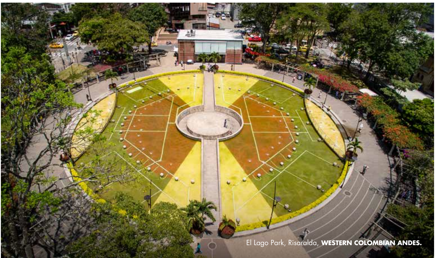
El Lago Park, Risaralda, WESTERN COLOMBIAN ANDES.