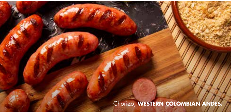
Chorizo, WESTERN COLOMBIAN ANDES.