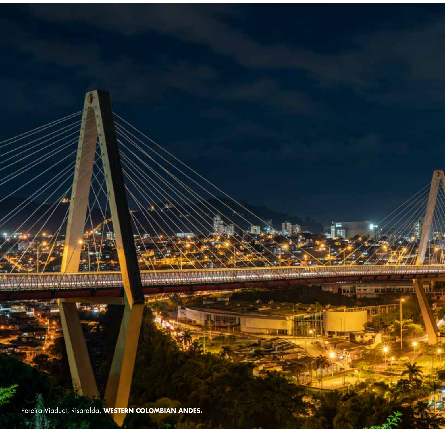
Pereira Viaduct, Risaralda, WESTERN COLOMBIAN ANDES.

Risaralda is deemed a department with a migrant soul because it sits on the path of diverse cultures, each of which has left a mark that is ingrained in the personality of the people of Risaralda to this day.