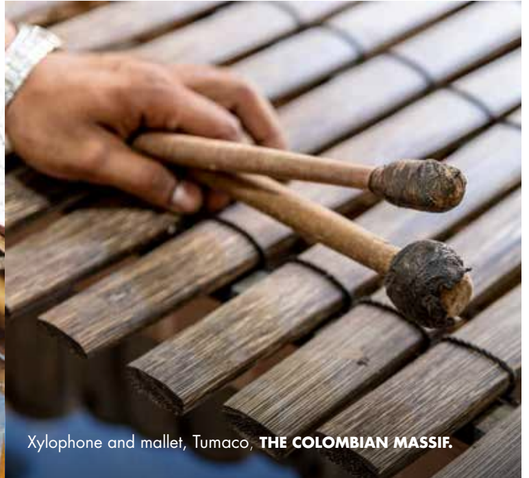
Xylophone and mallet, Tumaco, THE COLOMBIAN MASSIF.