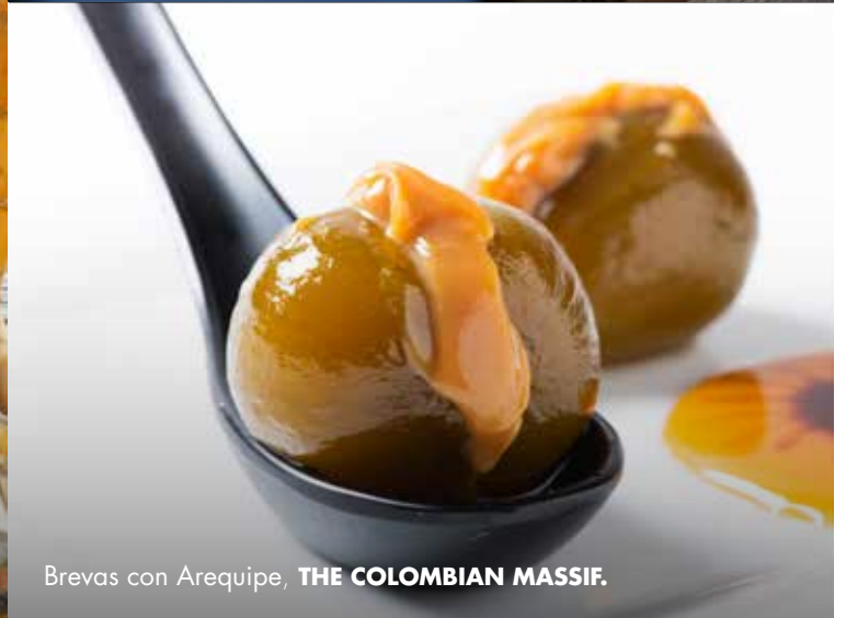
Brevas con Arequipe, THE COLOMBIAN MASSIF.

and corn on the cob), juanesca (fish soup), tomato dessert, chilacúan (papayuela), blackberry, brevas (breba figs) or pumpkin sweets and motilón wine. In Tumaco, the classic noteworthy dishes are fish, crab or prawn stews, shellfish ceviche, prawn ceviche; arroz atollado (rice and meat dish), arroz con toyo (toyo fish and rice dish) and seafood casserole. Drinks include arrechón (tomato-based drink) and biche (sugar cane-based drink).