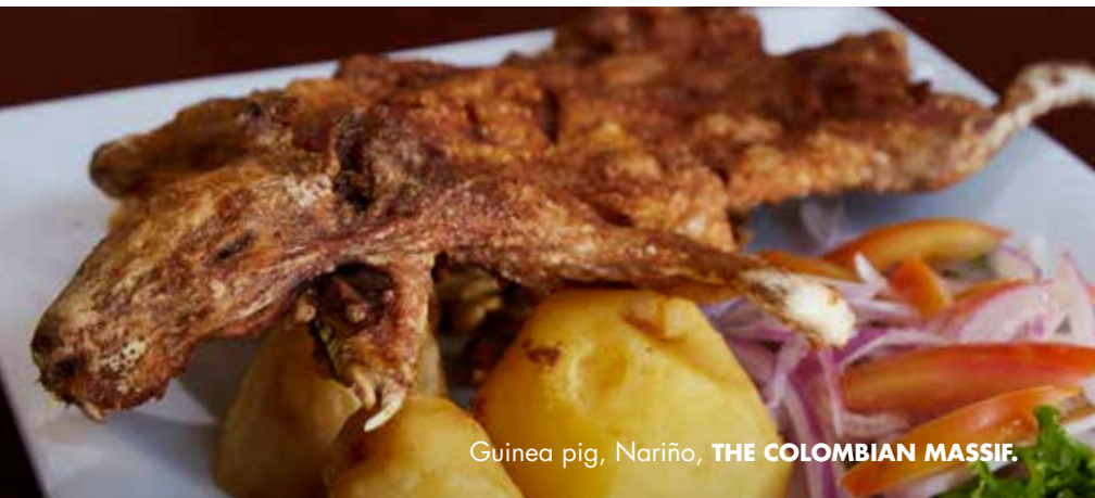
Guinea pig, Nariño, THE COLOMBIAN MASSIF.