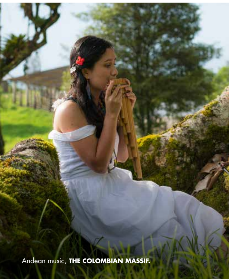
Andean music, THE COLOMBIAN MASSIF.

Indigenous, Afro-descendants, mestizos and white people, a blend that enhances an already culturally rich department.