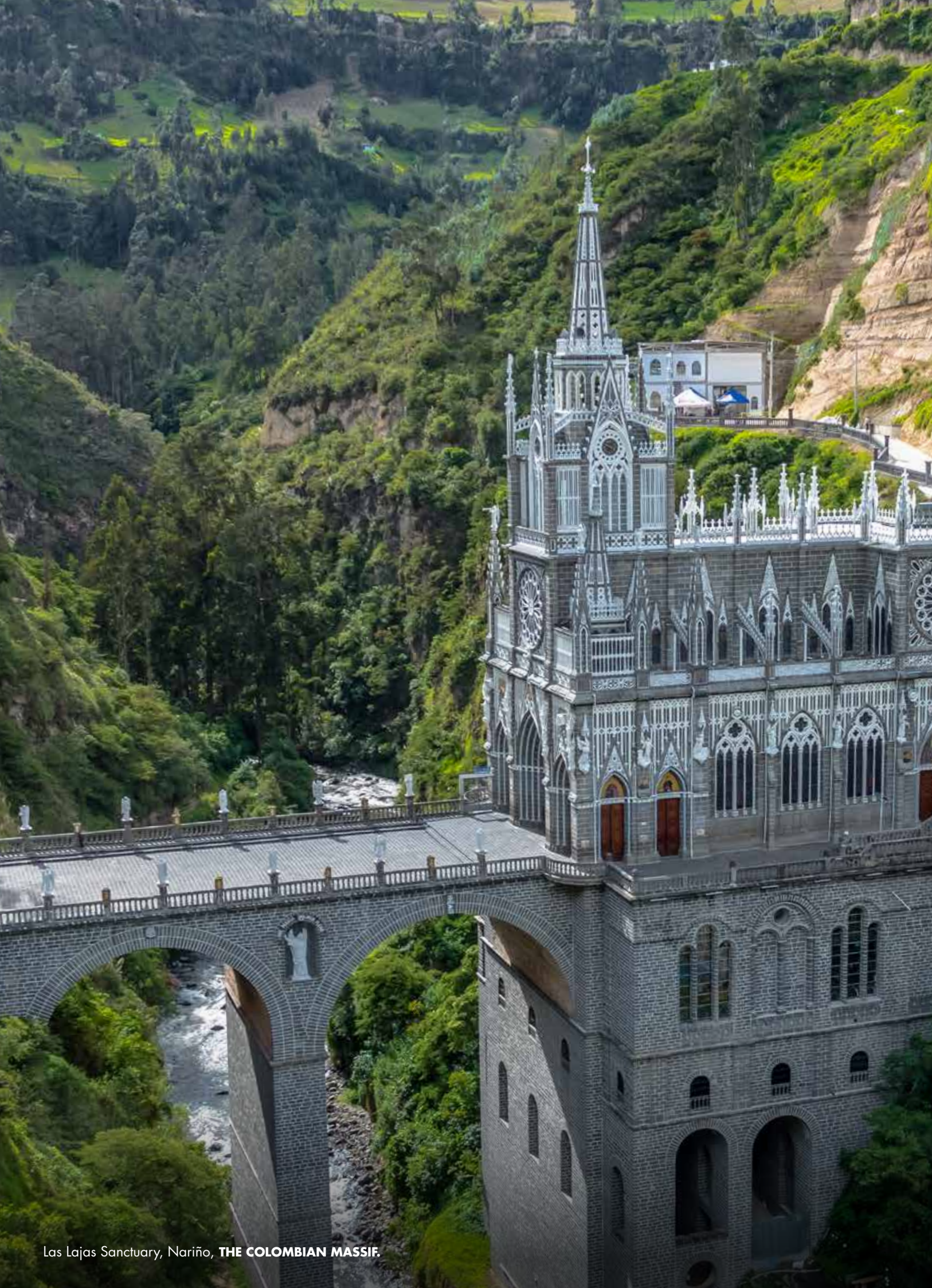
Las Lajas Sanctuary, Nariño, THE COLOMBIAN MASSIF.