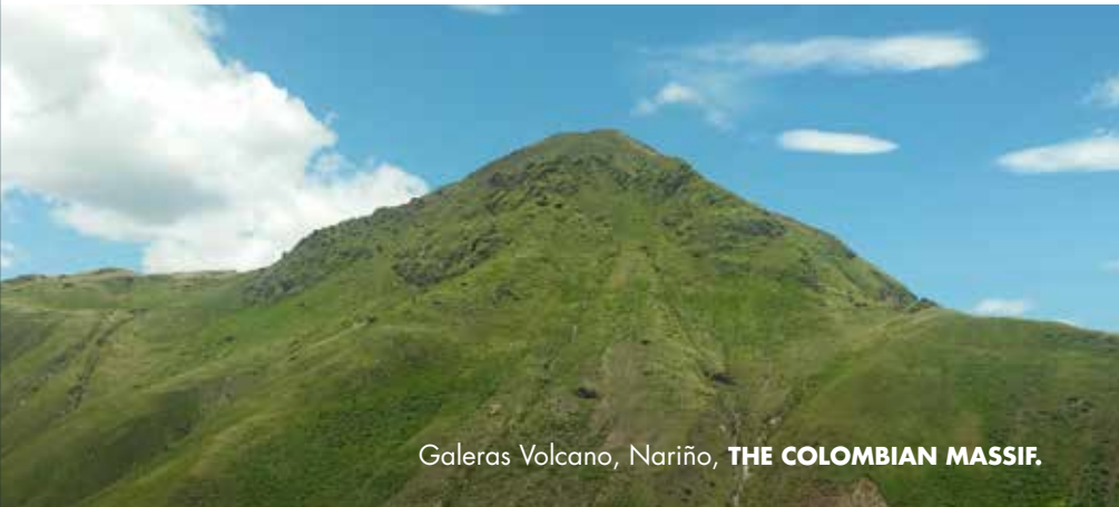
Galeras Volcano, Nariño, THE COLOMBIAN MASSIF.

It spans from Ipiales to Pasto. Ever since its recognition by UNESCO, it has become an element that bolsters identity.