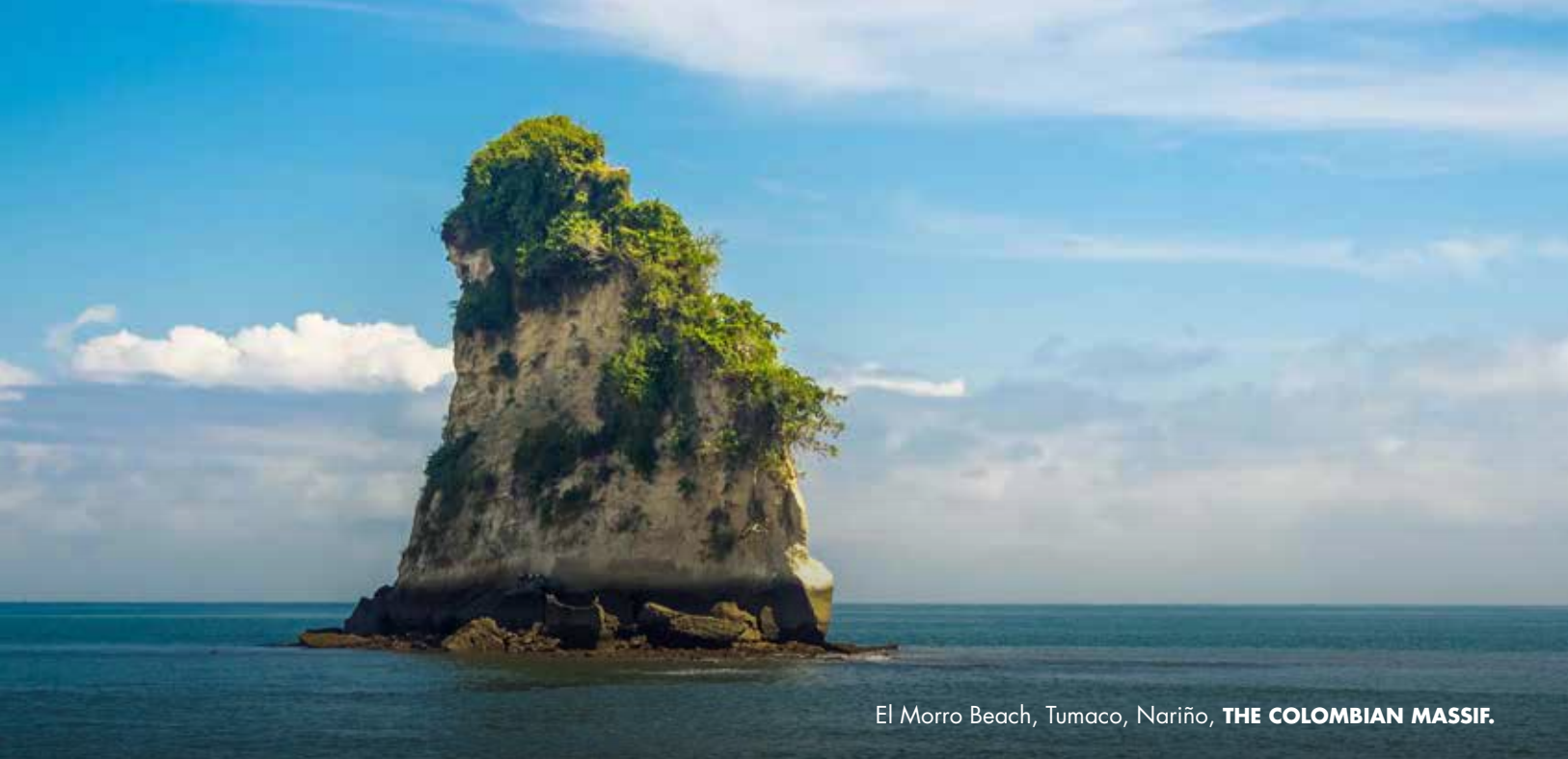
El Morro Beach, Tumaco, Nariño, THE COLOMBIAN MASSIF.