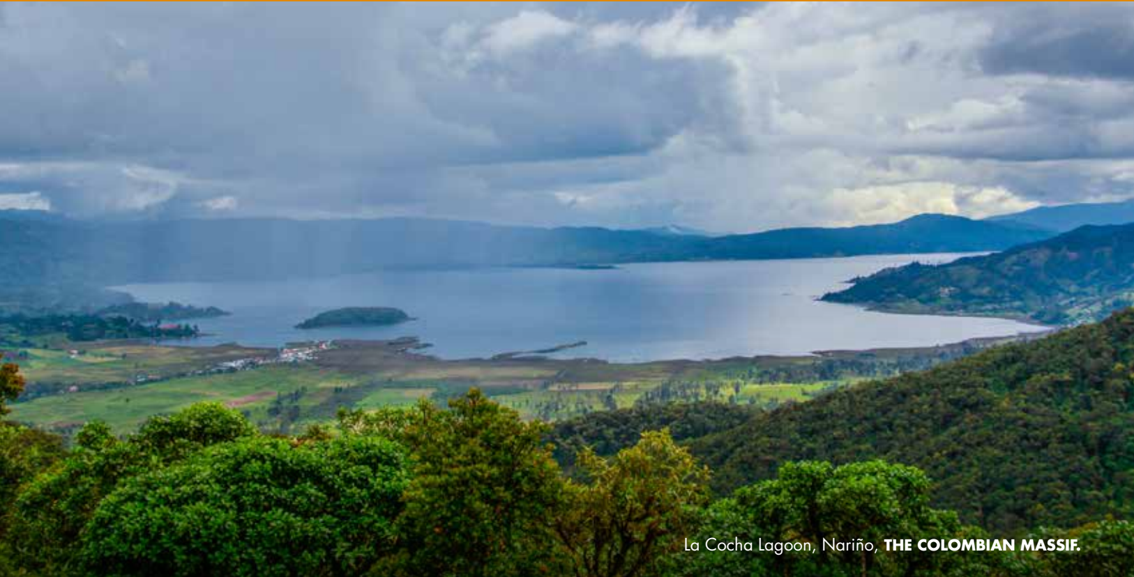
La Cocha Lagoon, Nariño, THE COLOMBIAN MASSIF.