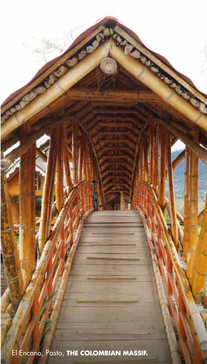
El Encano, Pasto, THE COLOMBIAN MASSIF.