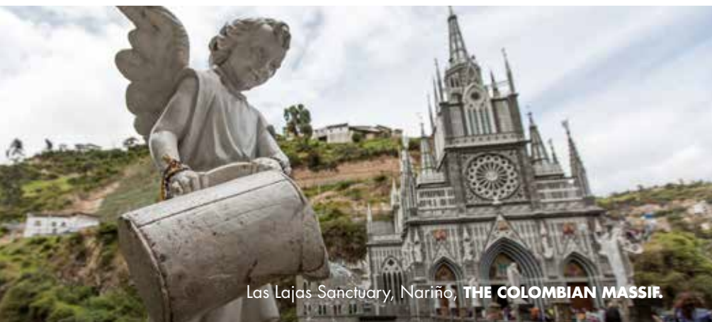
Las Lajas Sanctuary, Nariño, THE COLOMBIAN MASSIF.

The Carnival of Blacks and Whites is the commemoration of miscegenation and country folk, of syncretism and of Afro, indigenous and white identities sharing the area.