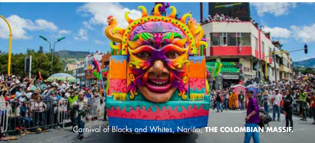
Carnival of Blacks and Whites, Nariño, THE COLOMBIAN MASSIF.

The Galerás Sanctuary, and notably its volcano, signify the mountain ranges and Nariño: "The children of the volcano." It is one America's most active volcanoes and its ecosystems are accountable for the huge array of the area's lagoons and species of flora and fauna.