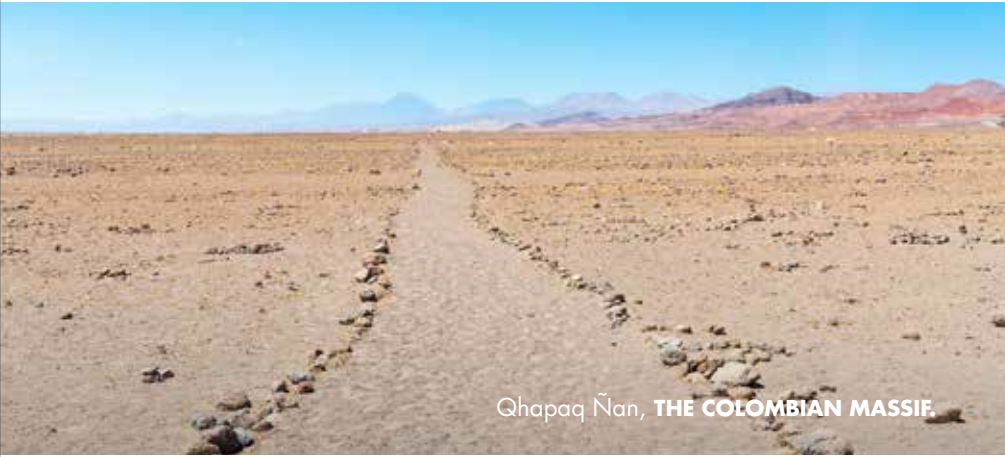
Qhapaq Ñan, THE COLOMBIAN MASSIF.