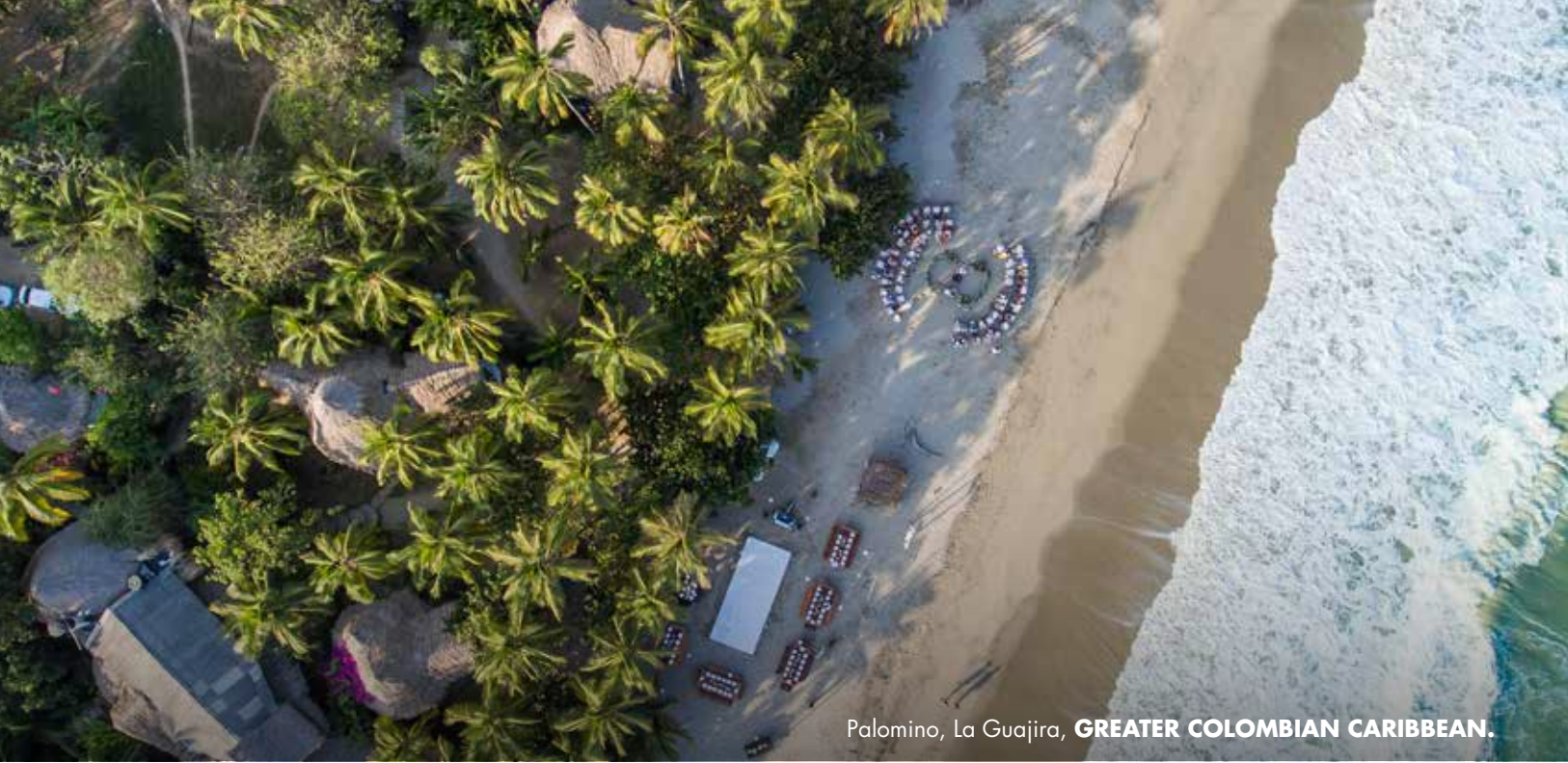
Palomino, La Guajira, GREATER COLOMBIAN CARIBBEAN.