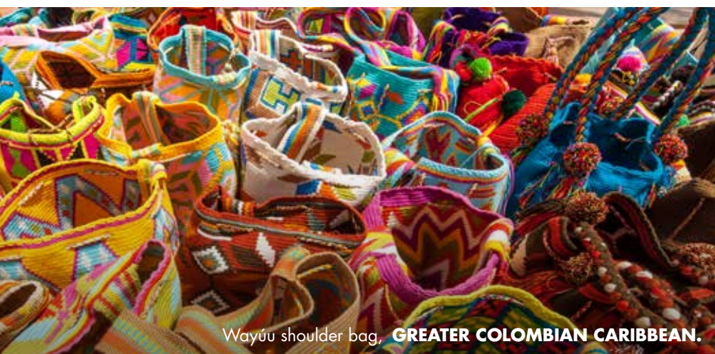
Wayú shoulder bag, GREATER COLOMBIAN CARIBBEAN.

A land steeped in wealth due to the seas, rivers, mountains and deserts it is home to.