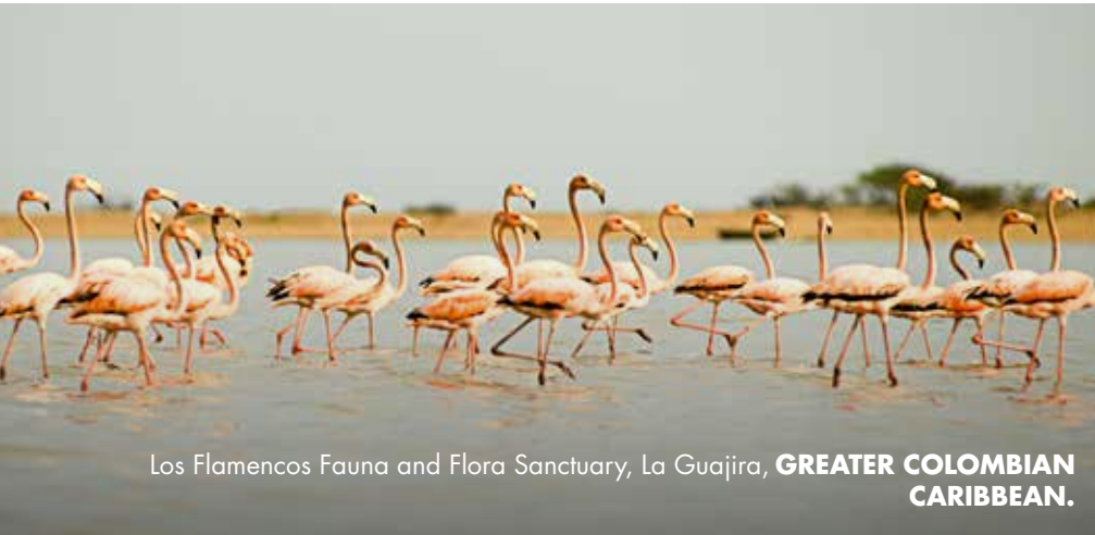
Los Flamencos Fauna and Flora Sanctuary, La Guajira, GREATER COLOMBIAN CARIBBEAN.

A department with a wide spectrum of indigenous cultures, where the Wayú people are distinguished by their strength, mysticism and ancestral customs.