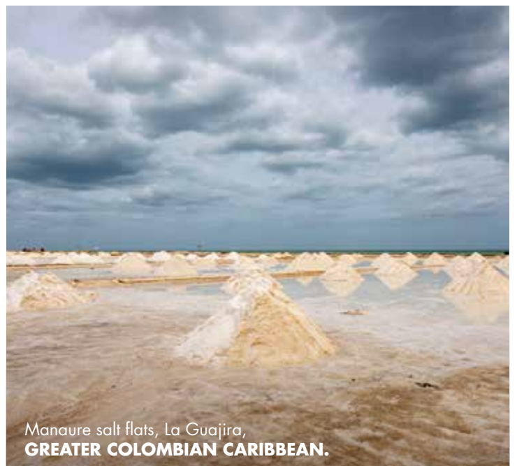
Manaure salt flats, La Guajira, GREATER COLOMBIAN CARIBBEAN.

"My grandparents used to tell me that all the plants that have manifested themselves have primarily come from the mountains, which is why nobody could get up there easily. It was a very sacred place that no one could climb, my grandparents told me that many did not return, as if they had been swallowed up."