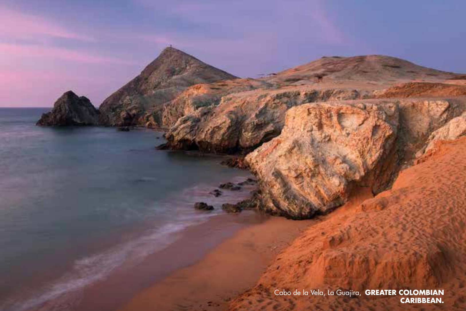
Cabo de la Vela, La Guajira, GREATER COLOMBIAN CARIBBEAN.

salt, it is a beautiful land. La Guajira is a lady leaning out towards the Caribbean Sea, with all her grandeur, her immensity, with all her majesty."