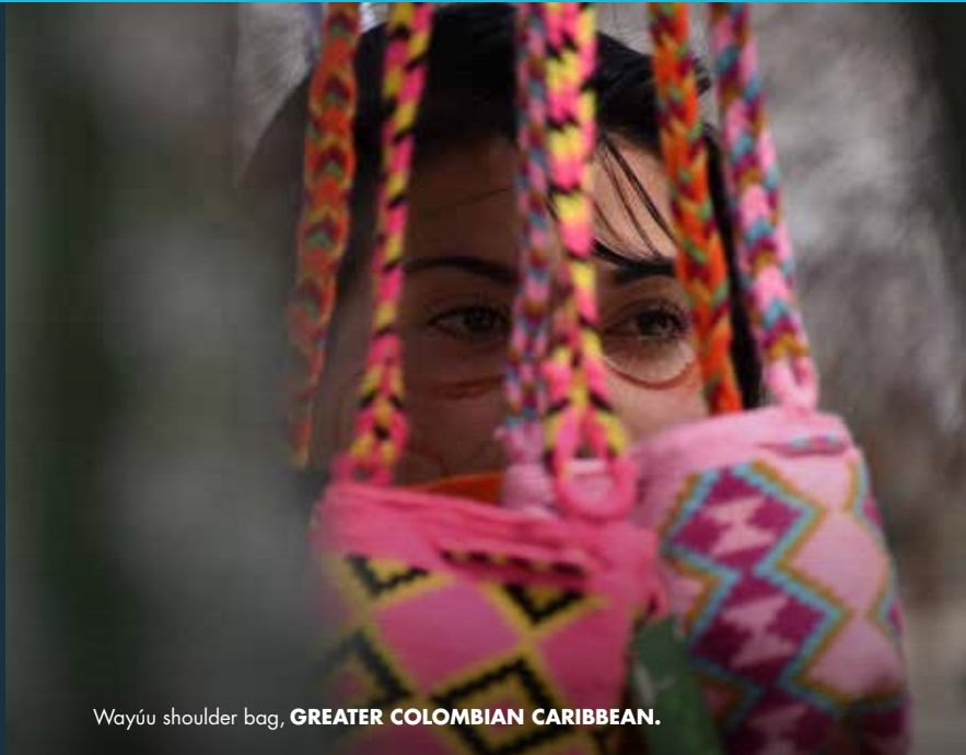
Wayúu shoulder bag, GREATER COLOMBIAN CARIBBEAN.