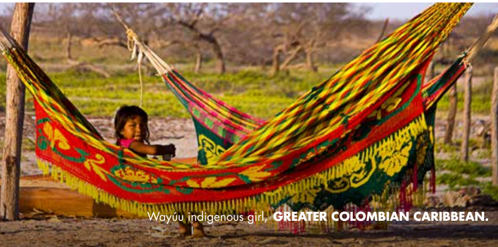
Wayú indigenous girl, GREATER COLOMBIAN CARIBBEAN.