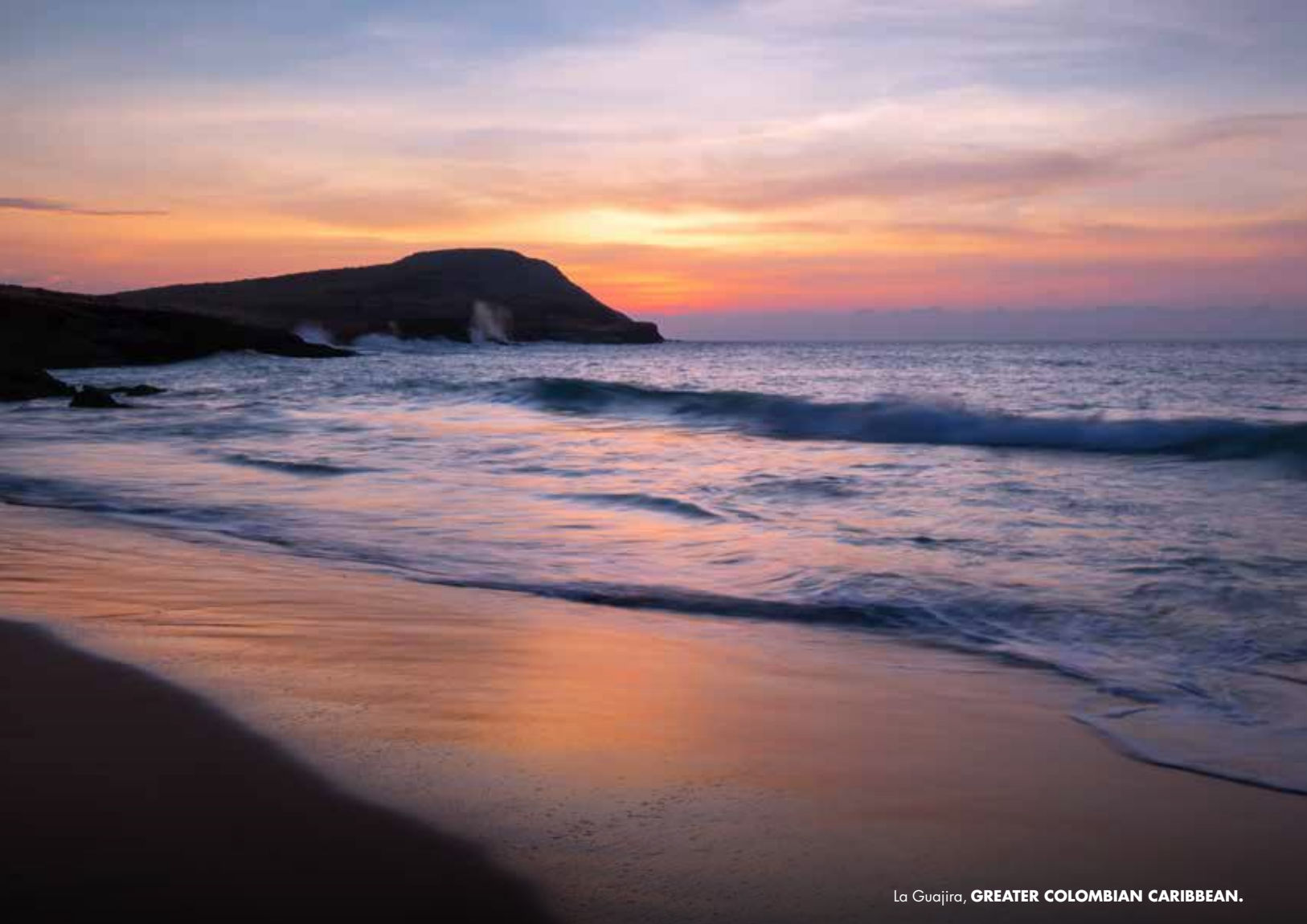
La Guajira, GREATER COLOMBIAN CARIBBEAN.