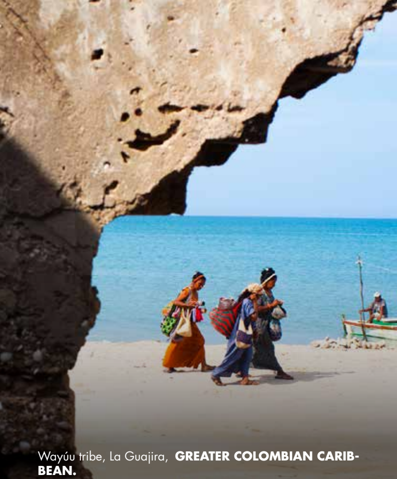
Wayúu tribe, La Guajira, GREATER COLOMBIAN CARIBBEAN.