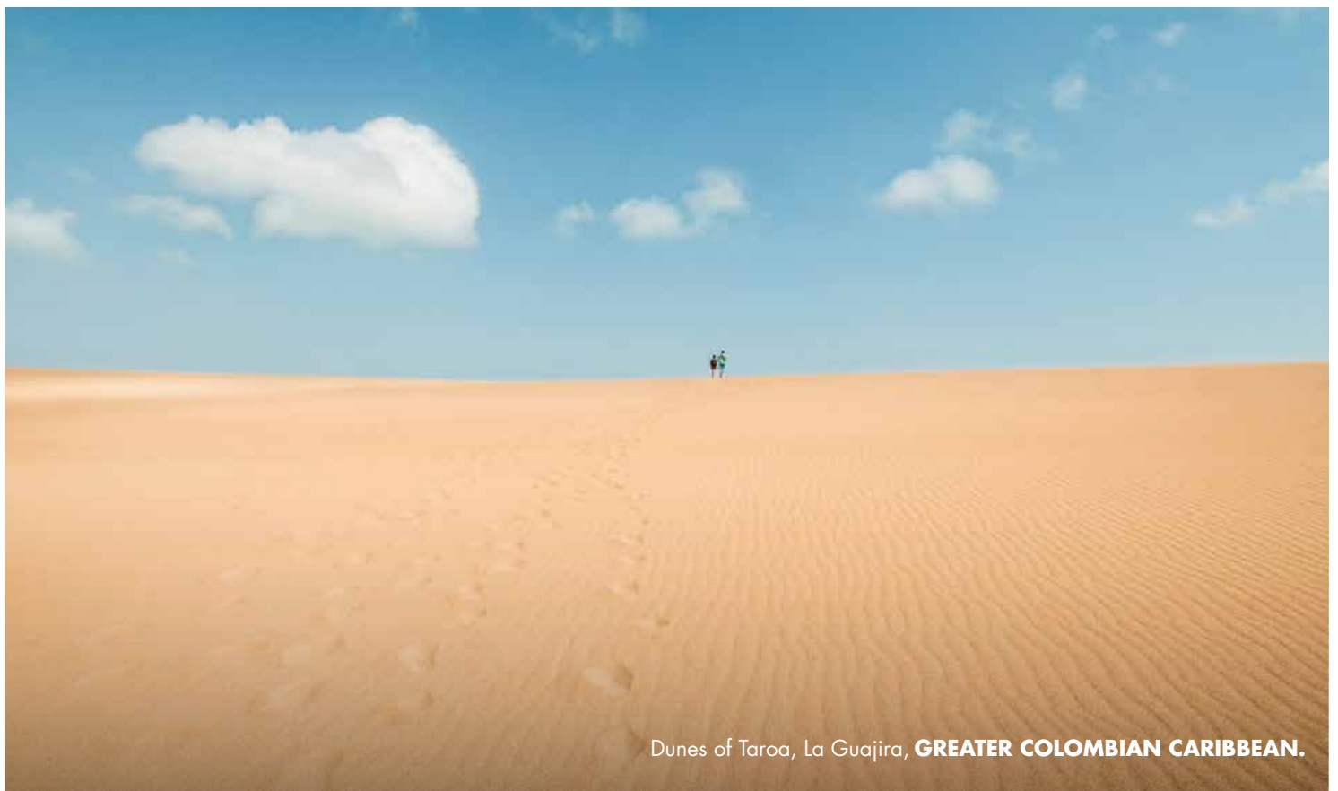
Dunes of Taroa, La Guajira, GREATER COLOMBIAN CARIBBEAN.