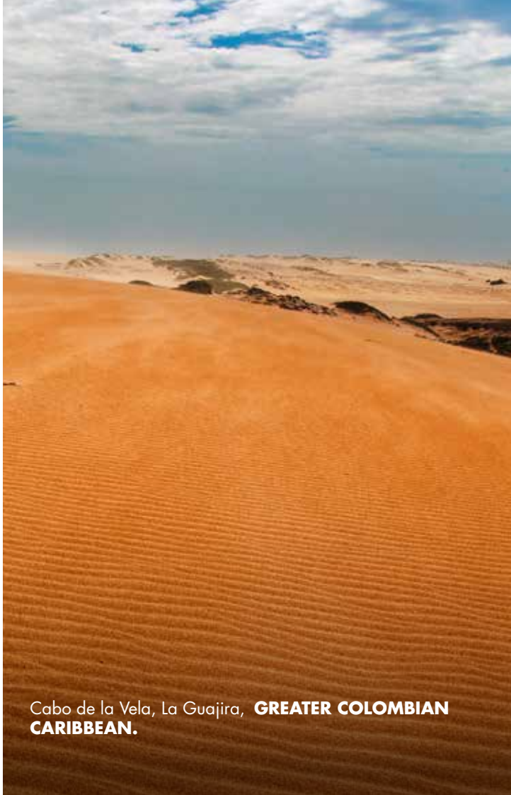
Cabo de la Vela, La Guajira, GREATER COLOMBIAN CARIBBEAN.

The desert holds more life than you might think, particularly when cultures, ancestral knowledge, mountains and rivers come together to create the ideal environment for biodiversity and cultural development.