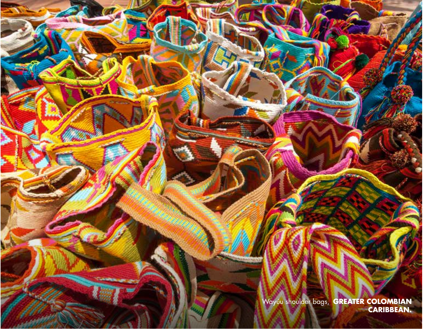
Wayú shoulder bags, GREATER COLOMBIAN CARIBBEAN.

“In the department of La Guajira, the main story or element that sets it apart from other tourist destinations is the culture, in particular the Wayúu, particularly considering that they are the most populous indigenous ethnic group in Colombia.”