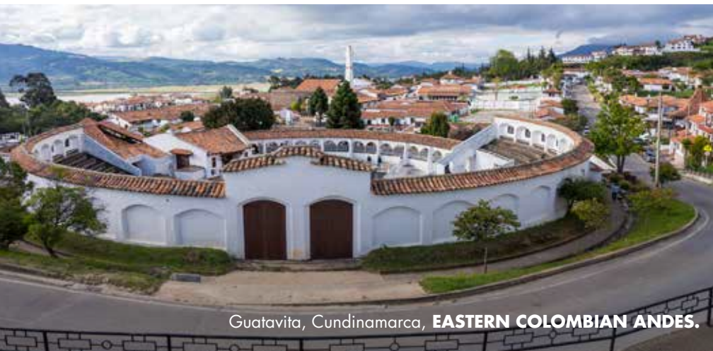
Guatavita, Cundinamarca, EASTERN COLOMBIAN ANDES.

It is a spectacular region of water-based landscapes with moorlands, lagoons, waterfalls, rivers and reservoirs.