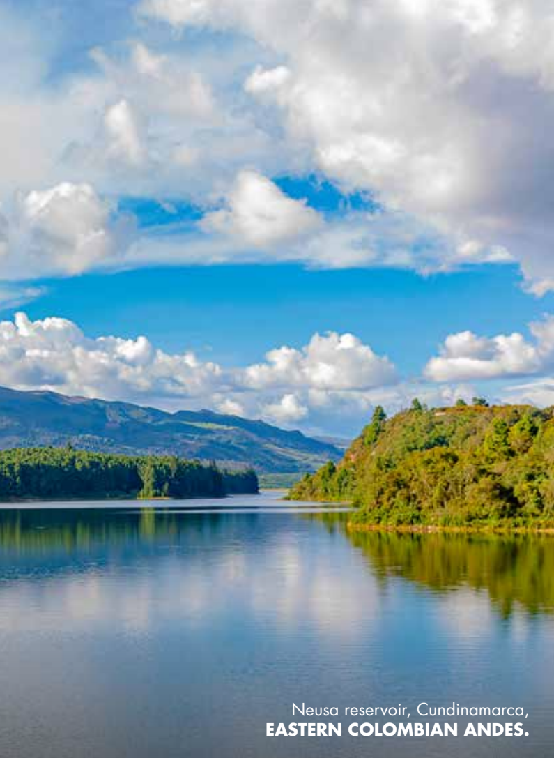
Neusa reservoir, Cundinamarca, EASTERN COLOMBIAN ANDES.

Water flows through the exquisite landscapes of Cundinamarca. There are breathtaking waterfalls, lakes, lagoons, rivers, wetlands and reservoirs that make enjoying this water an amazing experience. No matter where visitors go, water will always be the distinctive hallmark. The power of the water is harnessed in its reservoirs to generate electricity, which supplies other regions of the country. “For instance, there is the Festival of Light in Mesitas, because we generate electricity. We generally do not generate electricity for Cundinamarca, but for other regions. We supply energy to a large part of Colombia,” stated a proud inhabitant of the department.