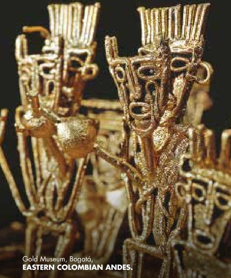
Gold Museum, Bogotá, EASTERN COLOMBIAN ANDES.