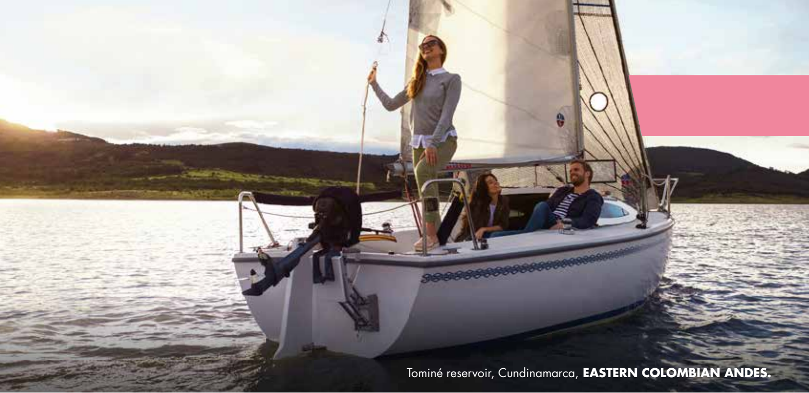
Tominé reservoir, Cundinamarca, EASTERN COLOMBIAN ANDES.