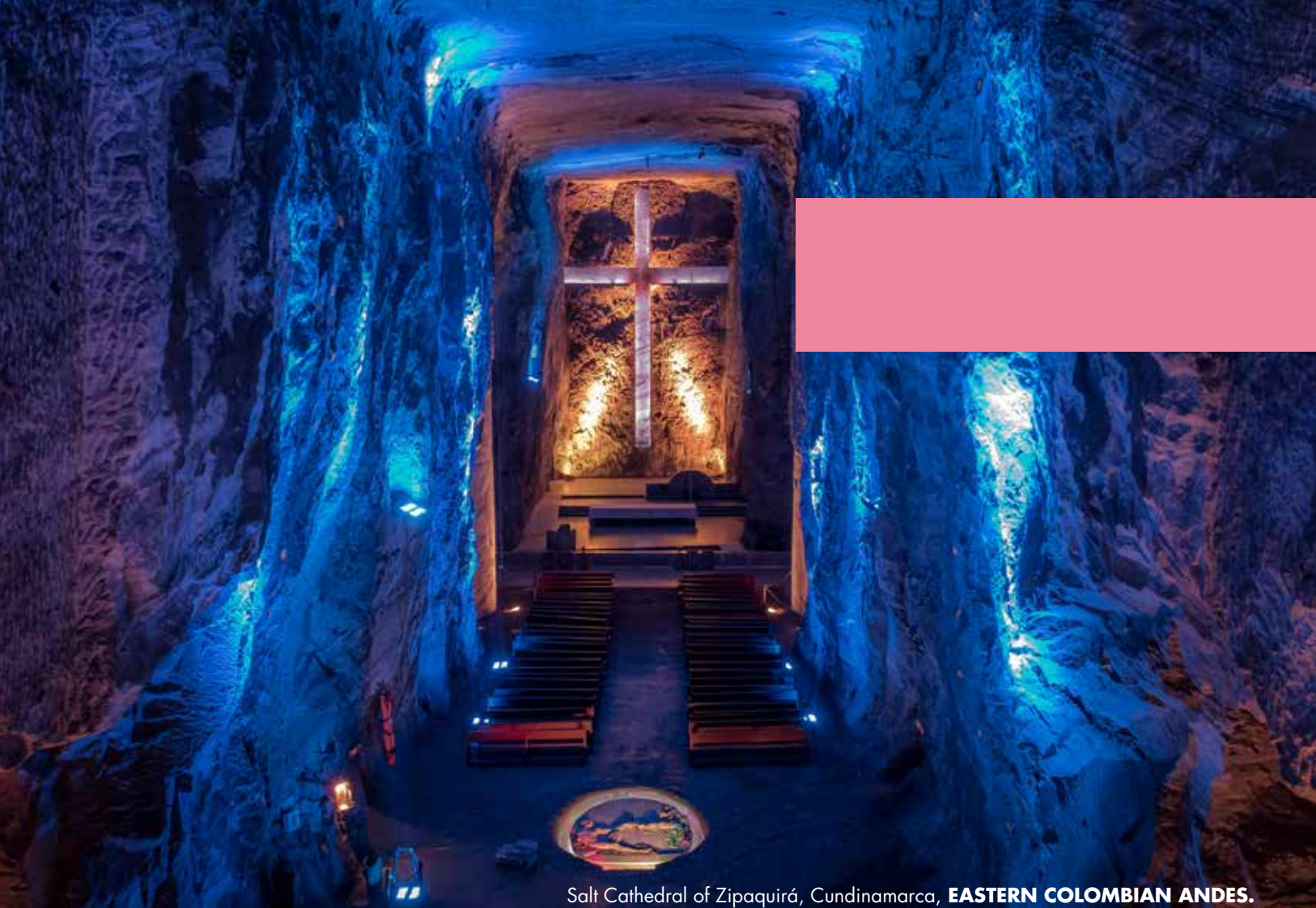
Salt Cathedral of Zipaquirá, Cundinamarca, EASTERN COLOMBIAN ANDES.