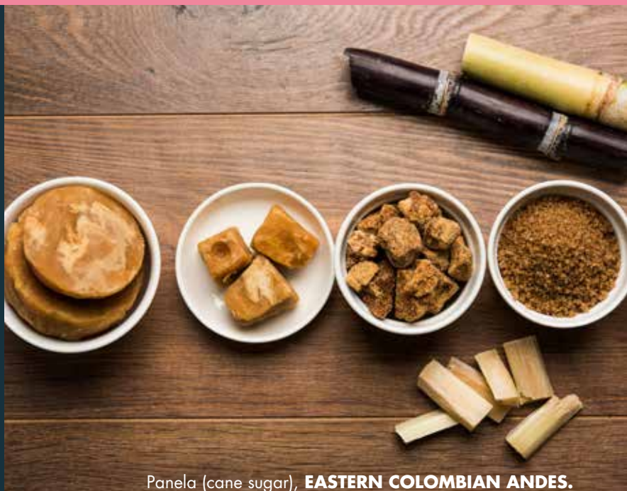
Panela (cane sugar), EASTERN COLOMBIAN ANDES.