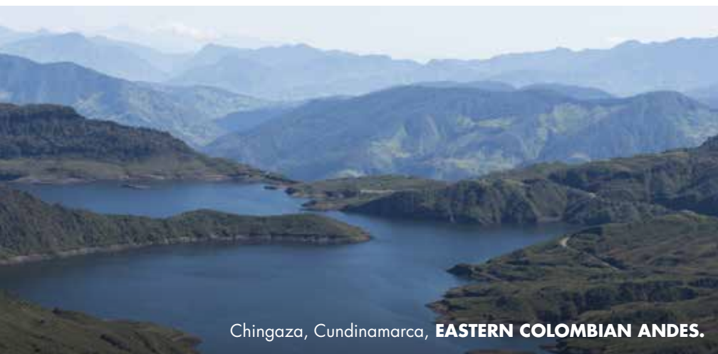
Chingaza, Cundinamarca, EASTERN COLOMBIAN ANDES.

Cundinamarca cares for and protects the natural resource venerated and protected by the Muisca. You can go on a magical pilgrimage along the trails leading to these sacred sites.