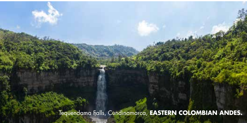
Tequendama Falls, Cundinamarca, EASTERN COLOMBIAN ANDES.