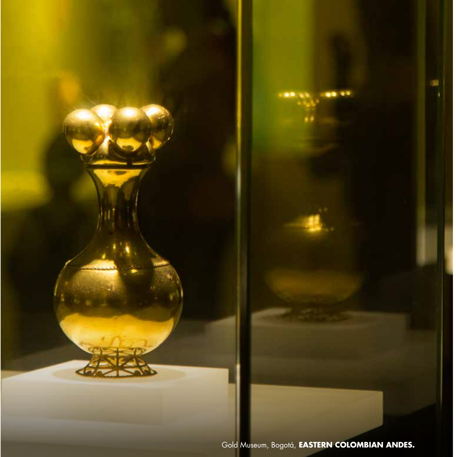
Gold Museum, Bogotá, EASTERN COLOMBIAN ANDES.

Thus, several of Cundinamarca's breathtaking tourist attractions are dedicated to this indigenous legacy, whose legends survive in places that were sacred to the Muisca, such as the Tequendama Falls, which were created by Bochica, and the spectacular Guatavita Lagoon, where it was believed that El Dorado, the mythical city of gold much sought after by the Spaniards, once stood.