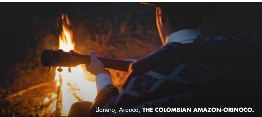
Llanero, Arauca, THE COLOMBIAN AMAZON-ORINOCO.

Figures that historically represent the bravery that identifies Llaneros.