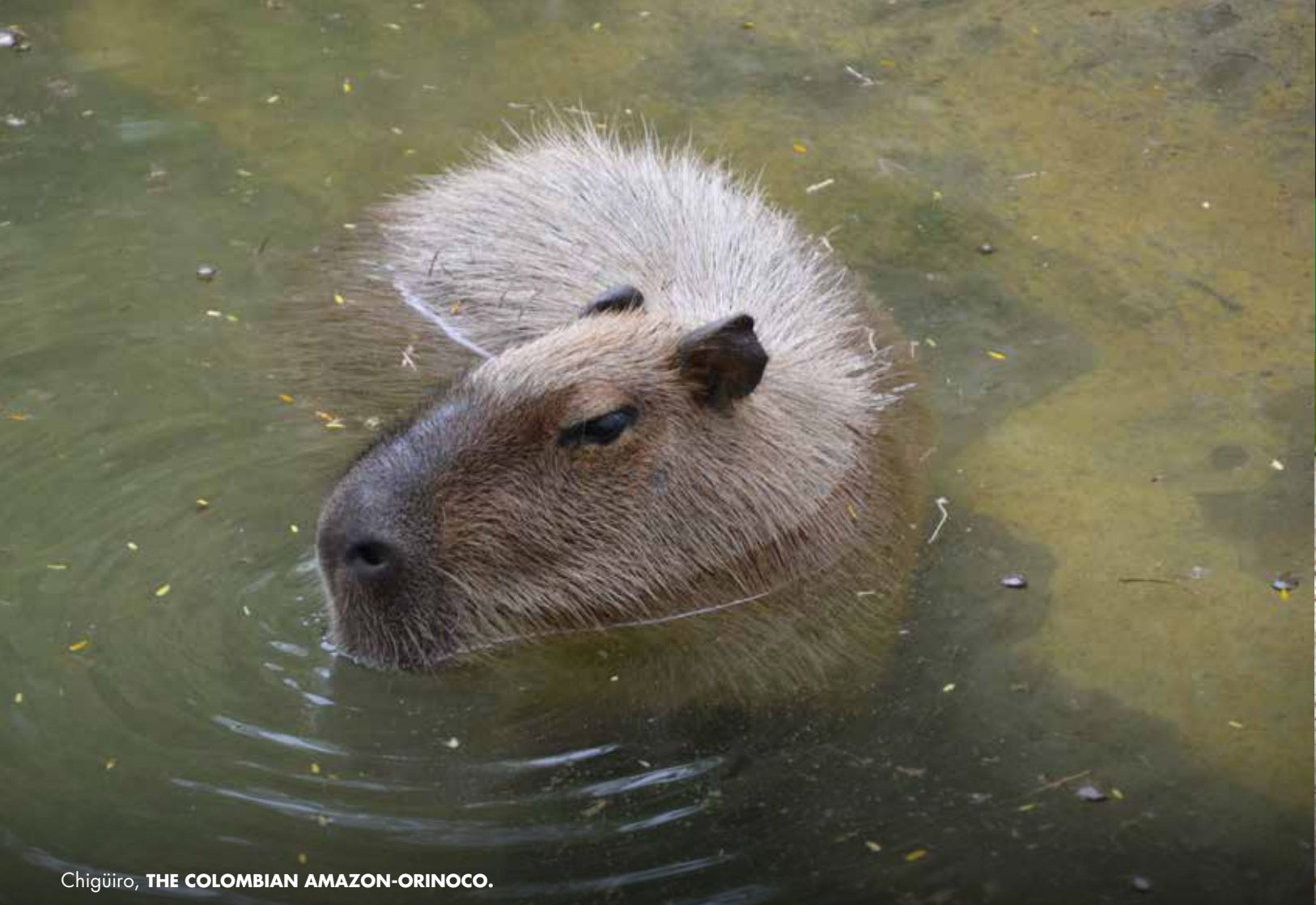
Chigüiro, THE COLOMBIAN AMAZON-ORINOCO.