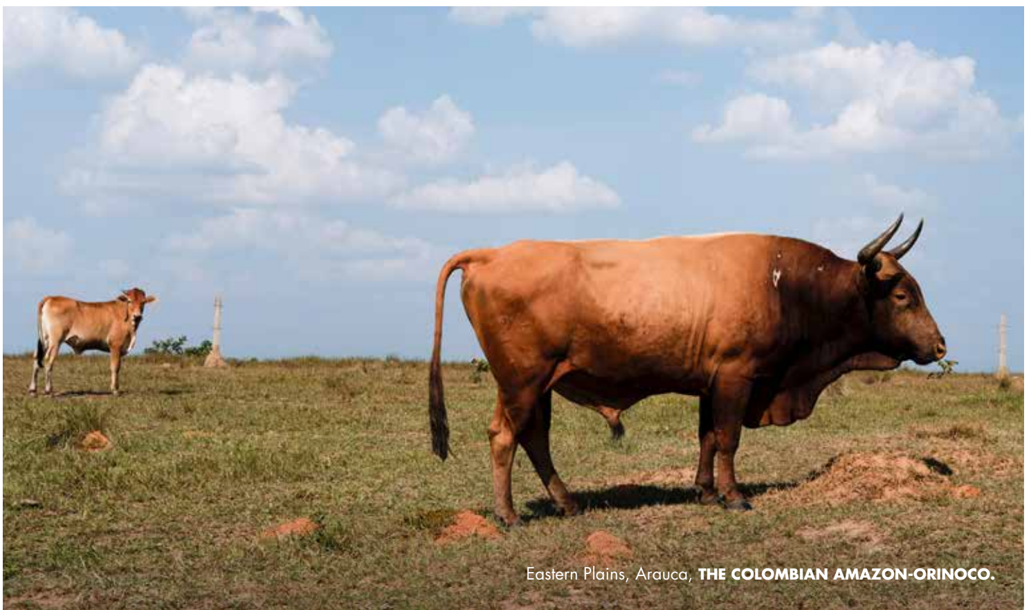
Eastern Plains, Arauca, THE COLOMBIAN AMAZON-ORINOCO.