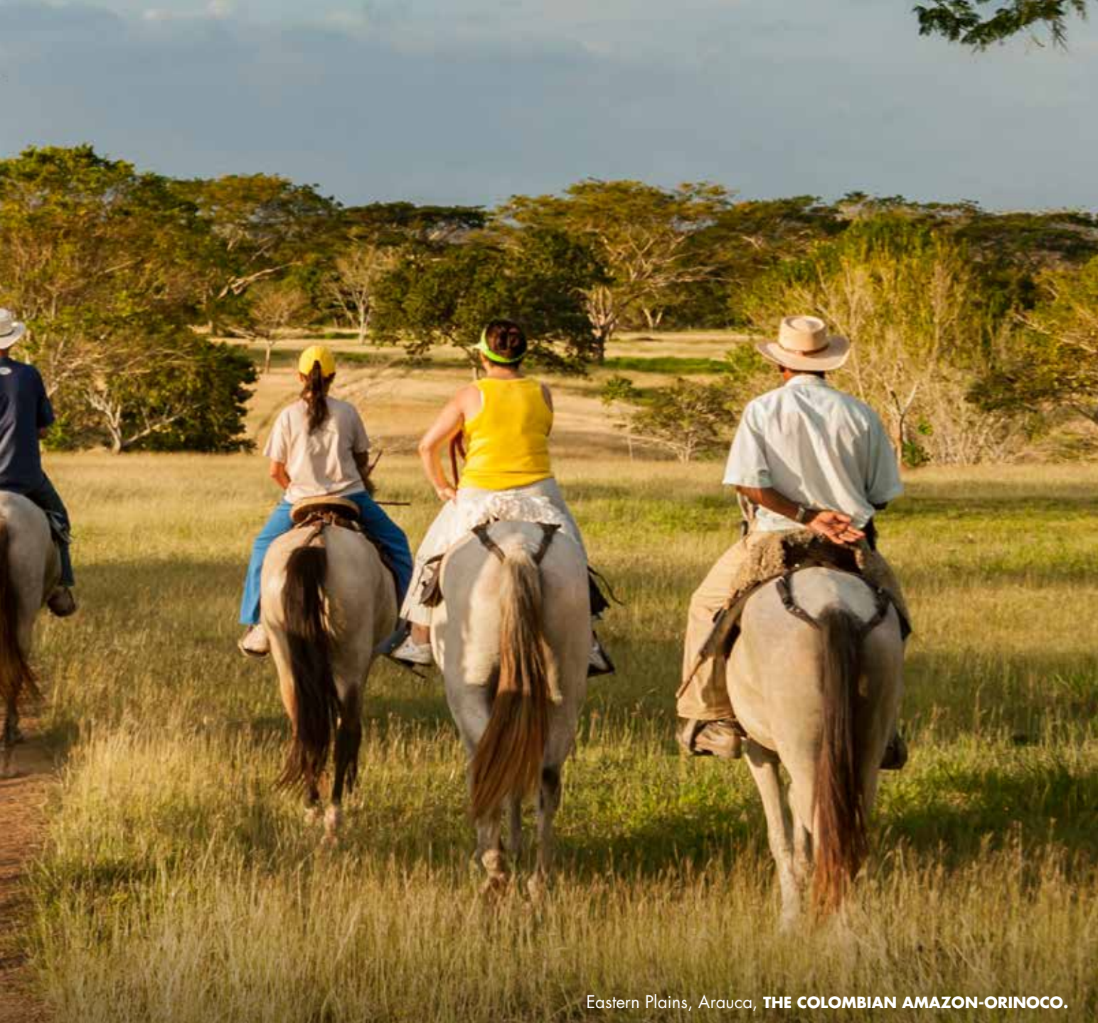
Eastern Plains, Arauca, THE COLOMBIAN AMAZON-ORINOCO.

They hold dear memories of the exploits of their ancestors, who transported cattle all over the Orinoquía region, on journeys that could last up to a month and a half. For this reason, they are seen in popular culture as representatives of the authentic Llaneros.