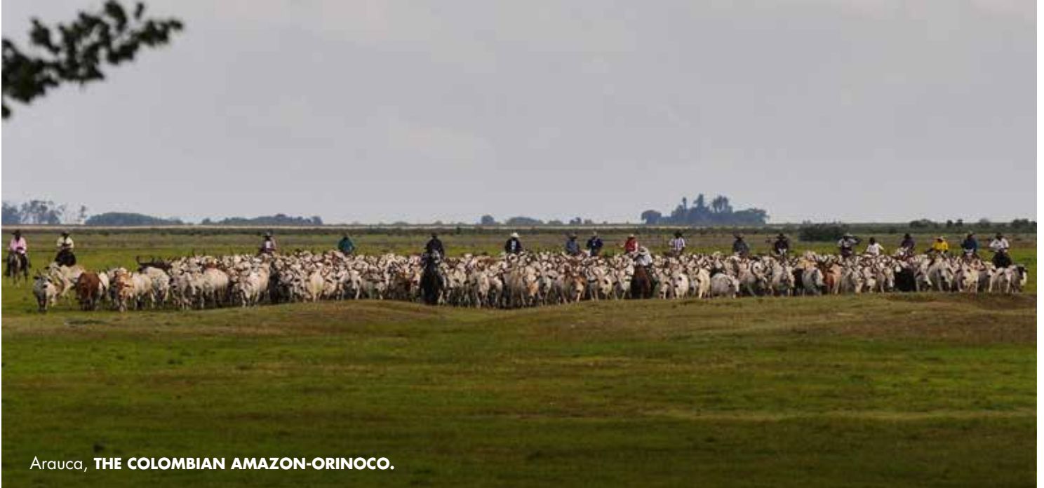
Arauca, THE COLOMBIAN AMAZON-ORINOCO.