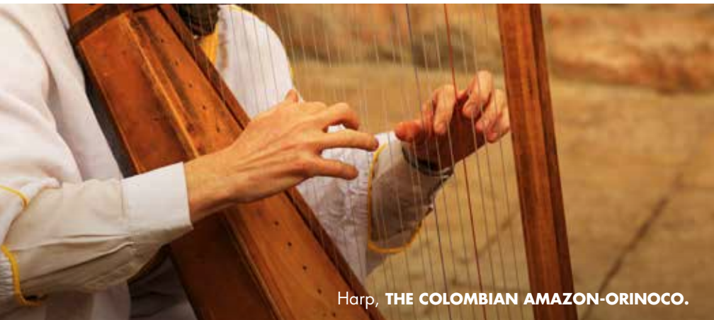
Harp, THE COLOMBIAN AMAZON-ORINOCO.

The craftsmanship that represents the department.