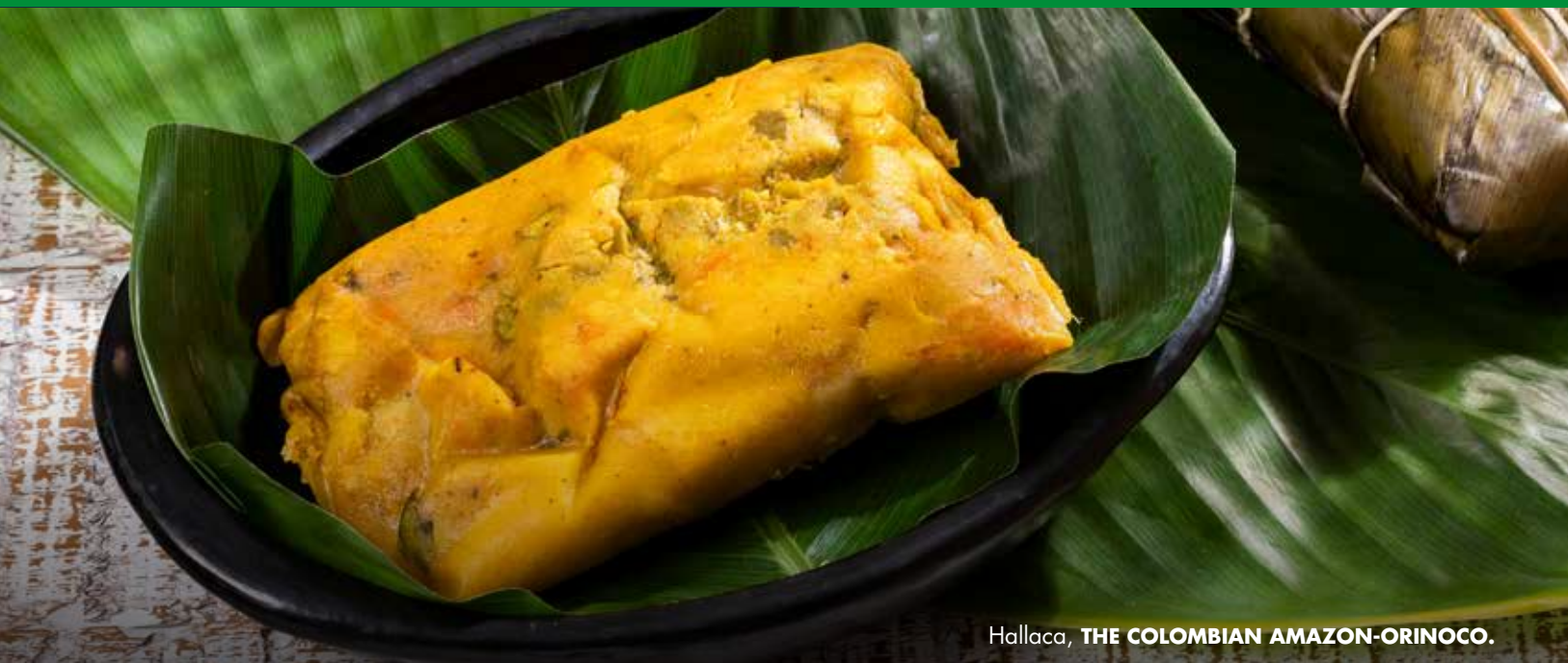
Hallaca, THE COLOMBIAN AMAZON-ORINOCO.