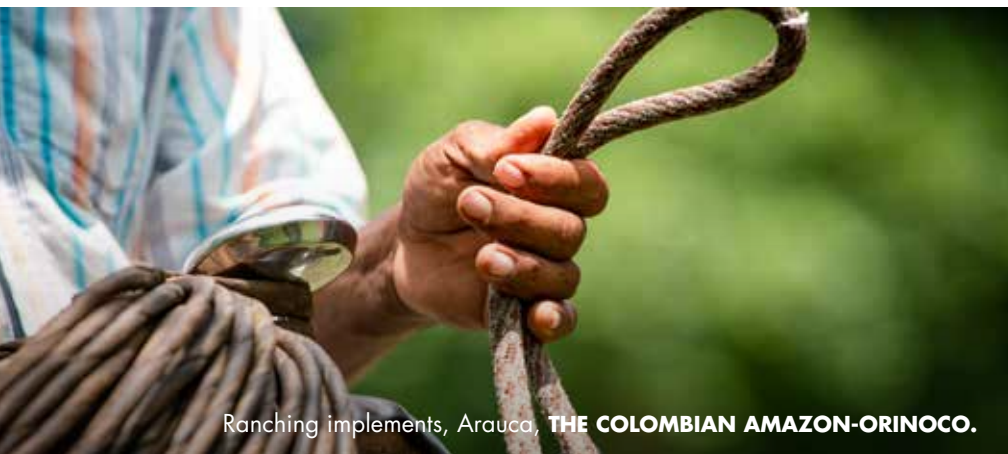
Ranching implements, Arauca, THE COLOMBIAN AMAZON-ORINOCO.