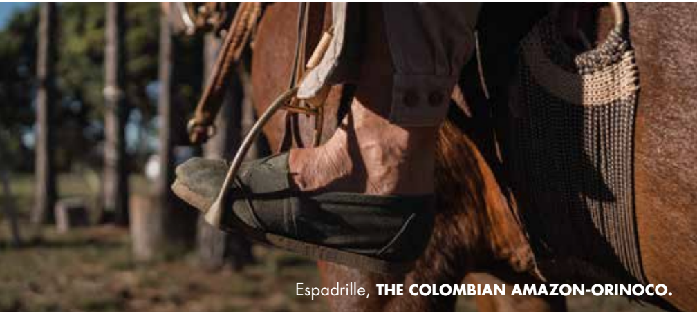
Espadrille, THE COLOMBIAN AMAZON-ORINOCO.

Reflecting the everyday life of the plainsmen of Arauca and their versatility in taming cattle.