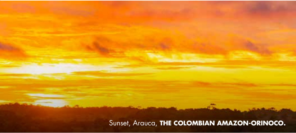
Sunset, Arauca, THE COLOMBIAN AMAZON-ORINOCO.