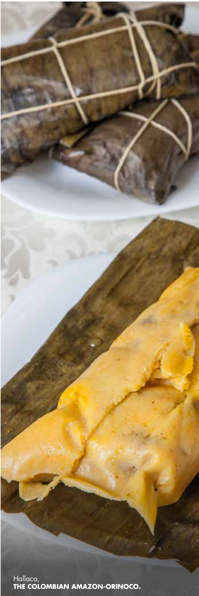
Hallaca, THE COLOMBIAN AMAZON-ORINOCO.

Its proximity to Venezuela means that it shares its gastronomy with the neighbouring country. The most popular dishes include hallaca (meat and vegetables in ground corn wrapped in a banana leaf), pisillo de chigüiro (capybara meat dish), Venezuelan arepa (corn patty), tumbos (banana passionfruit) and sopa de picadillo de carne seca (minced beef soup). In their recipes they use wild and exotic animals typical of the plains, such as deer, capybara, wild pig, chicamo, Llanos side-necked turtle, speckled caiman.