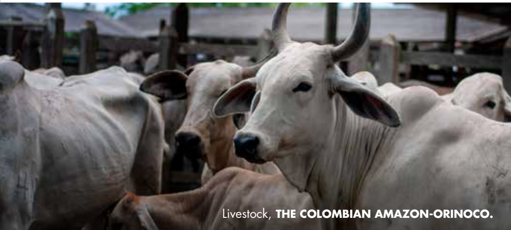
Livestock, THE COLOMBIAN AMAZON-ORINOCO.

Marking the relations between two nations, cultures and peoples.